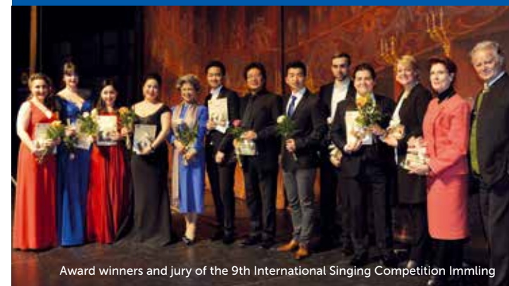
Award winners and jury of the 9th International Singing Competition Immling